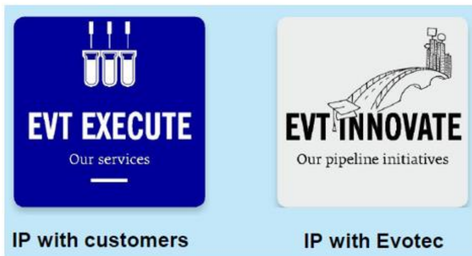
Figure 1. Evotec's business units.

For projects that belong to the EVT Execute section, Evotec provides a broad range of scientific services that cover all of the steps of the discovery and preclinical development of a medicine. In exchange Evotec will receive a fee-for-service or different combinations of upfront payments, research fees, development milestones and royalties on future sales. Cost efficiency and faster progression for medicine candidates are the added values that make a collaboration with Evotec so appealing, to smaller biotech companies but also to Top 20 global pharma clients such as Roche, Novartis, Novo Nordisk, Takeda, Sanofi and others.